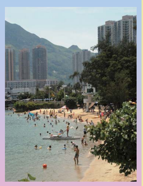
Castle Peak Beach