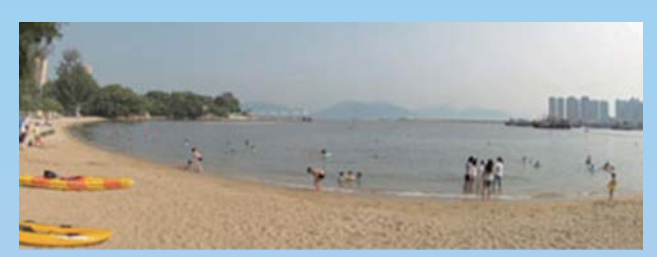
Clean water and clear sky greet swimmers at Castle Peak Beach

Improvement programmes have successfully achieved clean water and made the beach safe for the public to swim.